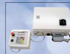
Control cabinet with PLC and remote control display

ENCODER EP machines can be converted into high-quality stand-alone pad printing machines using the controls from TAMPOPRINT. So that all print technical standards of the other machine series are immediately freely controlled.