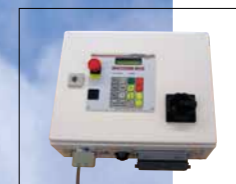
Control cabinet with PLC and operator display integrated in PLC cabinet