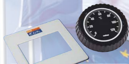
Automation with pad ventilation for light switch frames