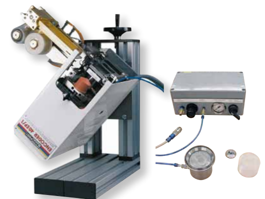
ENCODER 40 EP/1 electropneumatic