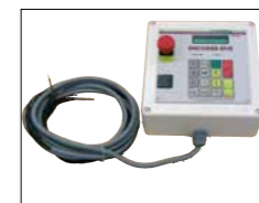
Remote control display, without PLC control