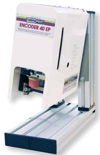
ENCODER 40 EP electropneumatic